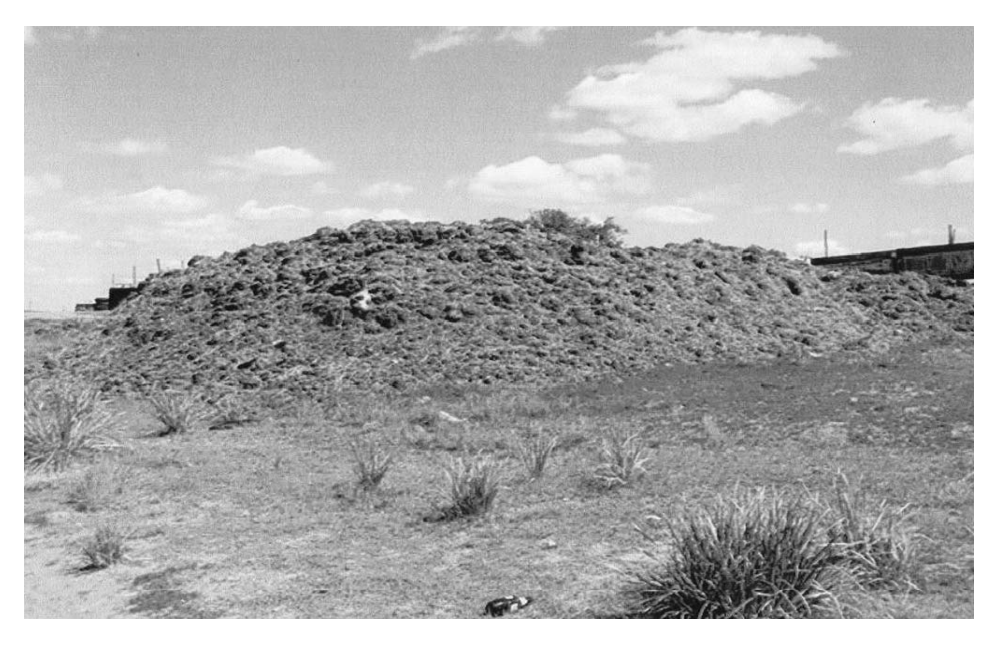
Figure 2. Manure rubbish that is concentrated on the banks of the river near the village Akzhol

All part of the territory from Karkaralinsk town to the village Akzhol takes only one settlement, it is village Akzhol. The riverbed in this region is obvious. Only in some parts is observed that there is no surface flow. Shore is mainly flat, but also found a high steep places. There are also hills of different heights. Signs of absolute height in the Karkaraly region is 820 m, near the village of Akzhol changed to 683 m. On the banks grow willows shrubs, herbaceous and shrubby plants. A significant portion of the river is located along the road linking the village Akzhol and «Karaganda-Karkaralinsk» road. During the research we noticed diffuse pollution sources (building materials, household waste, manure pile, etc.) are found on the banks and riverbeds of the river located within the village (Fig. 2).