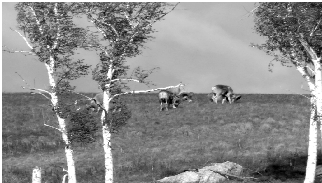
Figure 1. Arkhara at pasturage

In the summer daily activity has pronounced recurrence. Arkhars begin to be grazed early in the morning with sunrise (Fig. 1) and late at night.