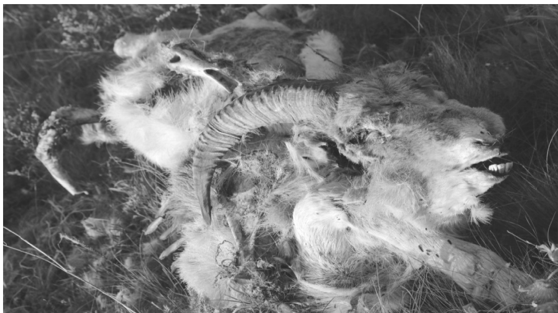
Figure 2. Remains of a young female

Important factor changes of number of arkhar are epidemics and epizodiya. Death caused by necrobatsileis a pyroplasmosis are known [12]. The most significant effect on the number of population of arkhar in Ermentau uplands, as well as in other regions of its habitats, is rendered by wolves (Fig. 2).